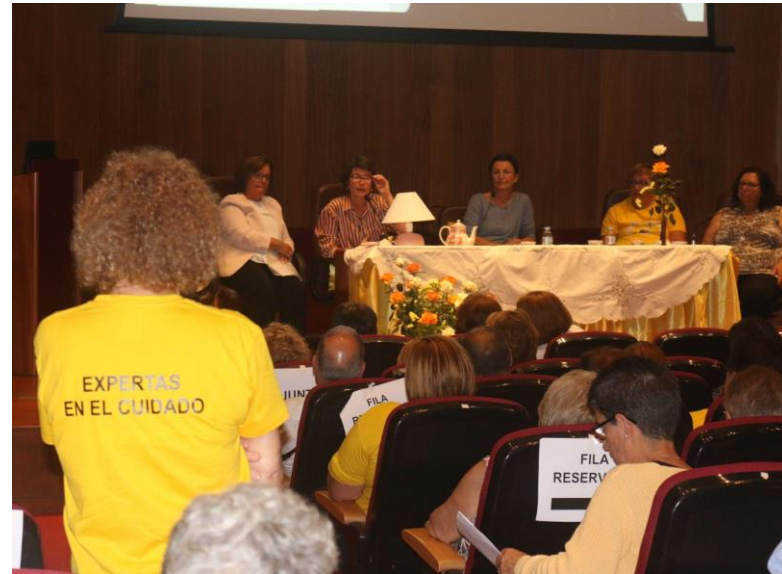
RESEARCH ACTIVITIES AND CAPACITY BUILDING