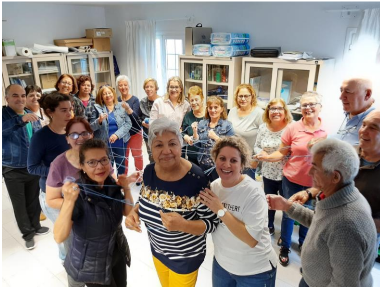
INDIVIDUAL AND GROUP SUPPORT SERVICES