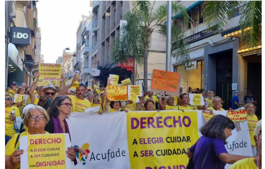
AWARENESS RAISING AND POLICY LOBBYING