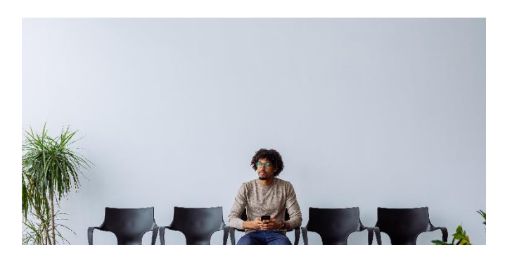
Staff shortages: one in six job advertisements concerns LTC occupations

The number of people in need of LTC will increase by 23% until 2050 (up to 38.1 million)